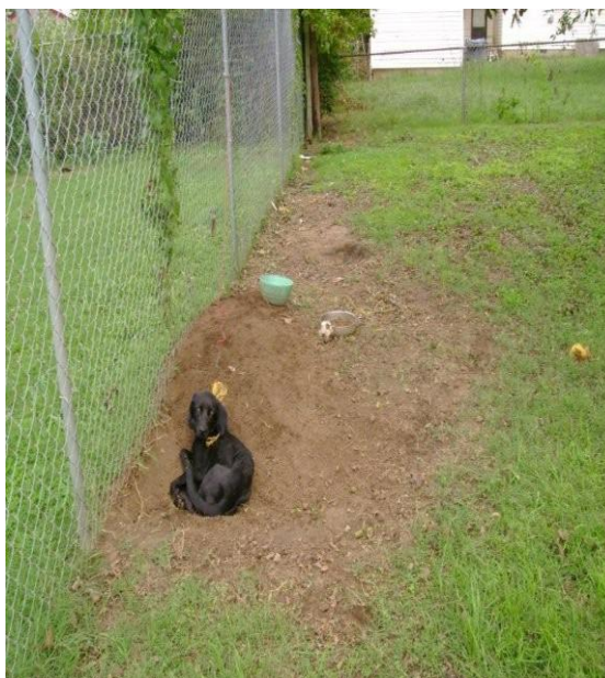
Lady Bug As She First Appeared