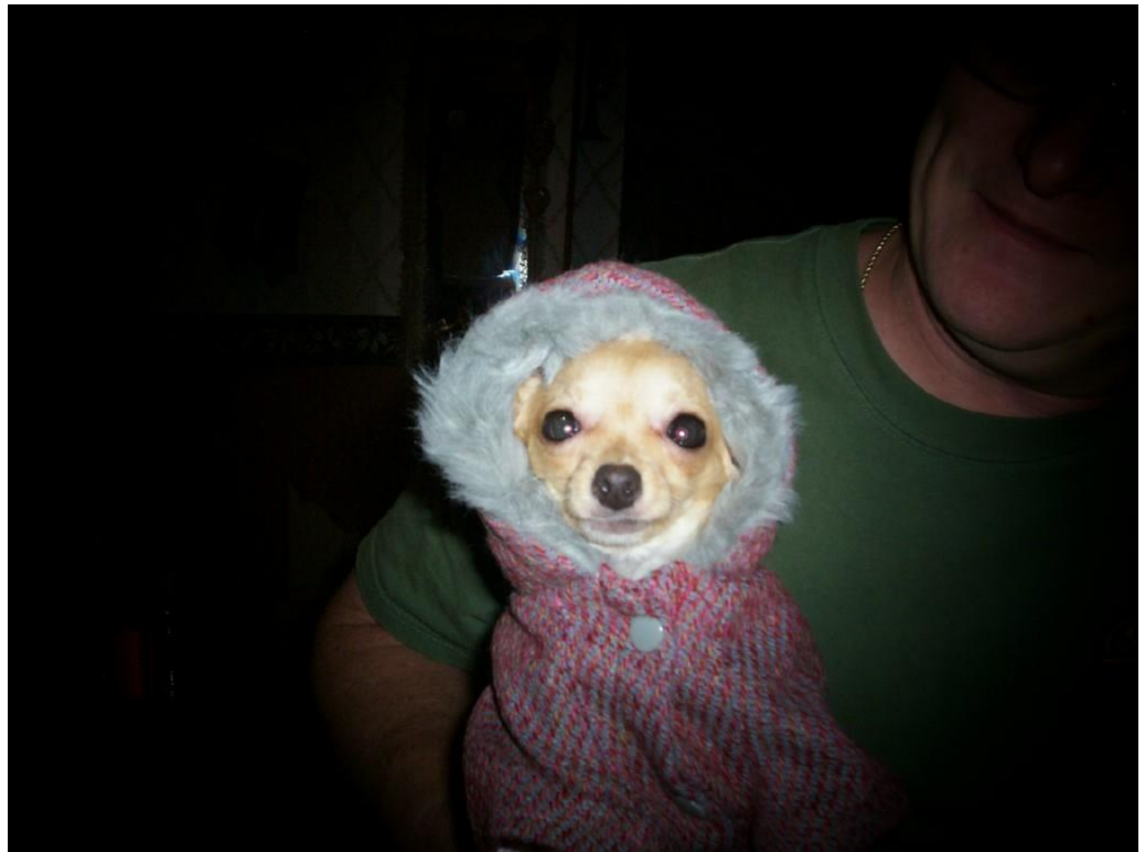
"Tinkerbelle" – All animals should be this well cared for!

PLEASE MAKE YOUR YEAR-END CHARITABLE DONATION NOW BY GOING TO OUR WEBSITE AT WWW.WOLFEPACKPRESS.ORG